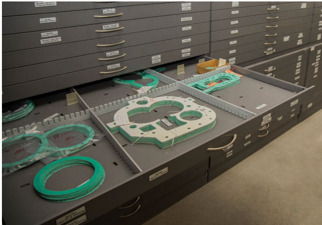
ARCTOS Spare Parts Warehouse